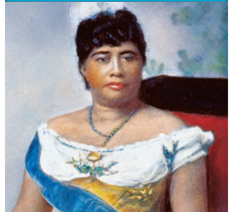
Queen Liliuokalani 1838–1917

Liliuokalani was Hawaii's only queen and the last monarch of Hawaii. She bitterly regretted her brother's loss of power to American planters and worked to regain power for the Hawaiian monarchy. As queen, she refused to renew a treaty signed by her brother that would have given commercial privileges to foreign businessmen. It was a decision that would cost her the crown.